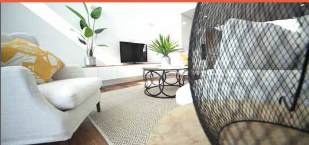
Two Bed / Two Bath