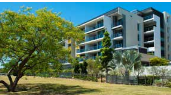
Room for the Grandkids!

As part of our impressive facilities our stunning cinema boasts 20+ oversized, cushioned armchairs for ultimate viewing comfort. Double doors preserve the acoustic integrity as the automatic lights dim to create an authentic cinema experience. Residents can partake in regular movie screenings or reserve the area for a private viewing of their favourite DVD. Nothing says summer sport better than a big screen. So whether it's watching Queensland bathe in Origin glory, staying up for the Wimbledon doubles or simply cheering on the race that stops the nation, our gold class quality cinema is the place to be.